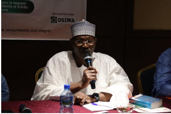
Professor Attahiru Jega, OFR, at the launch of The Electoral Forum