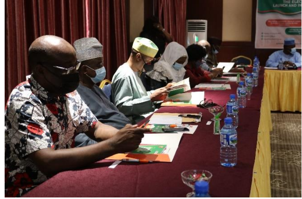
Some members of The Electoral Forum